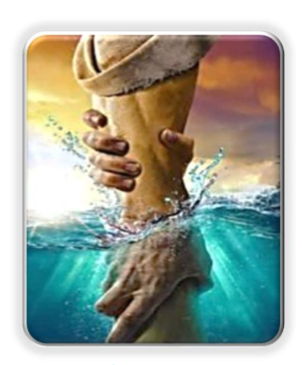
There's Always Hope Friend

"In my distress I cried unto the LORD, and he heard me." Psalms 120:1