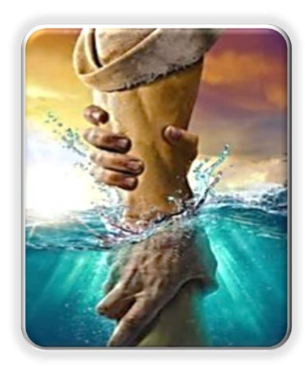
There's Always Hope Friend

"In my distress I cried unto the LORD, and he heard me." Psalms 120:1